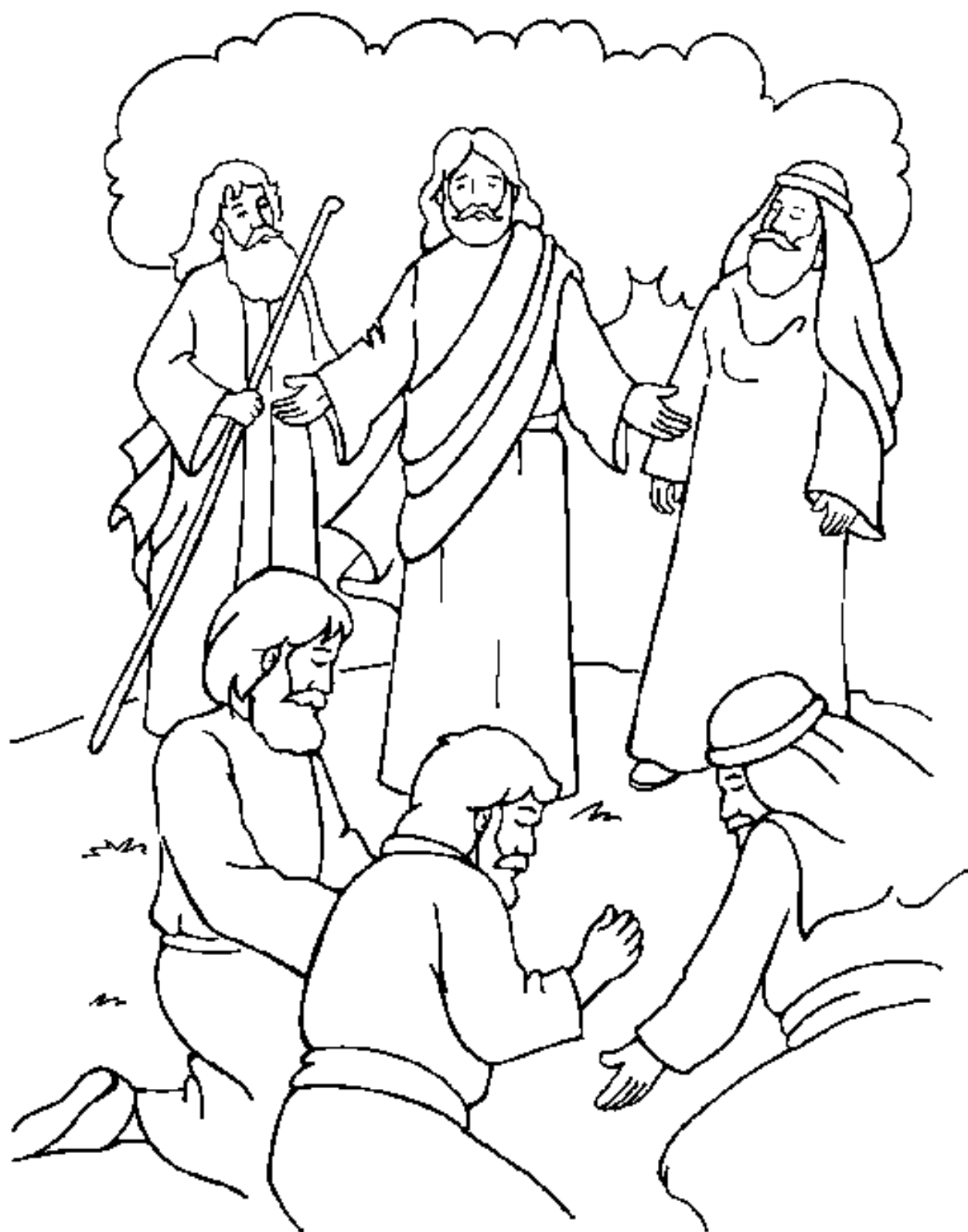
The Mount of Transfiguration Mark 9:2-9