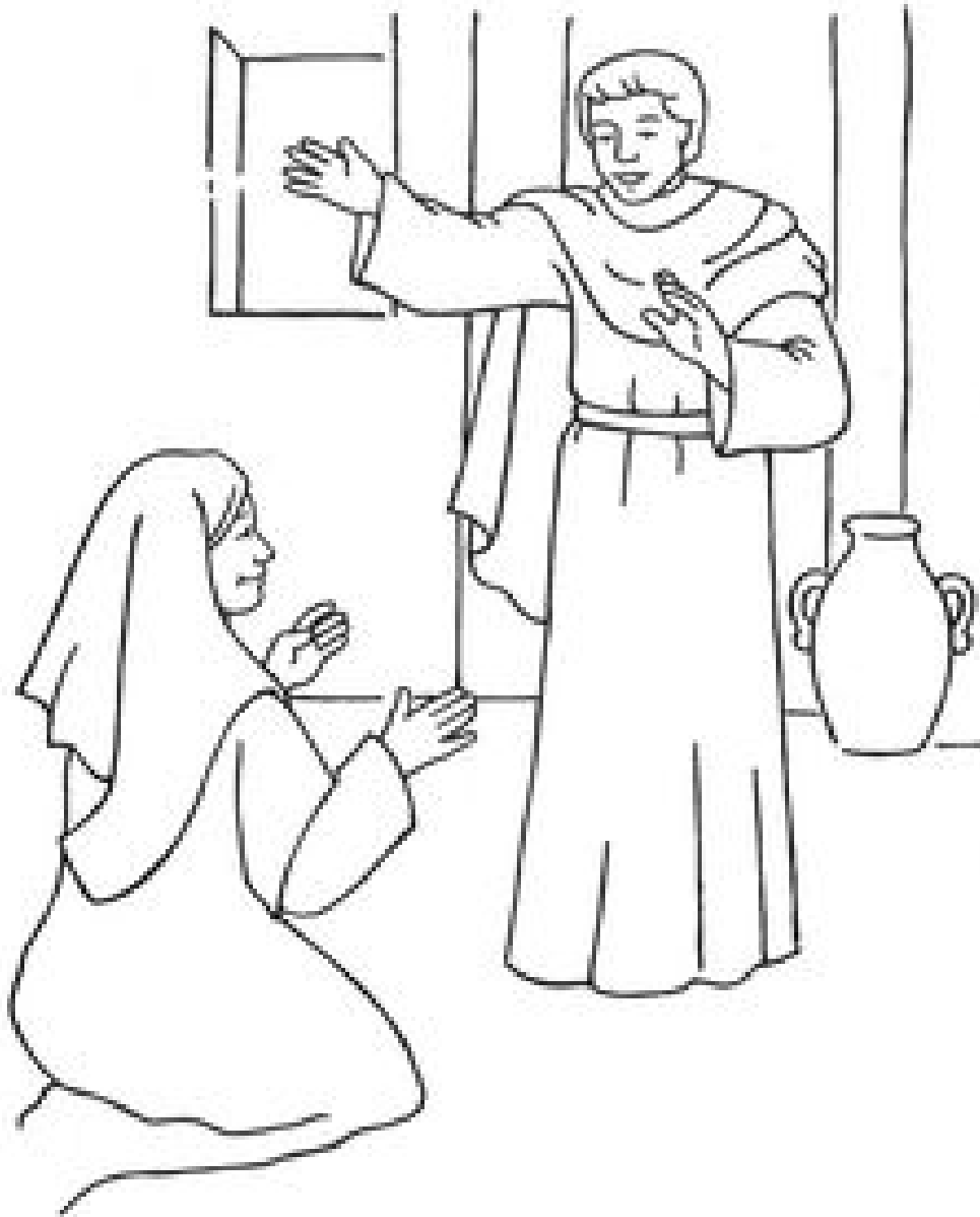
An Angel Visits Mary Luke 1